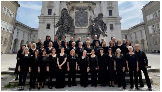
Paragon/Laudate Touring Choir in front of the Salzburg Cathedral, one of our performing venues, June 2023

May 27th is your opportunity to hear the tour repertoire at an informal concert and to bid the choir farewell.